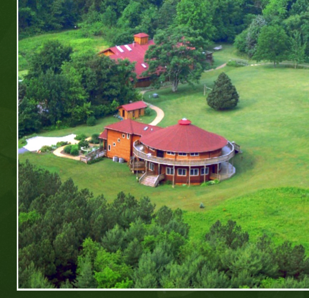
Aerial photo of meditation hall